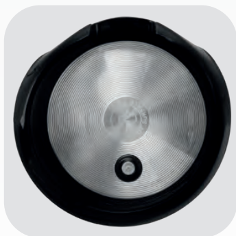
PATENTED INDUCTION TECHNOLOGY