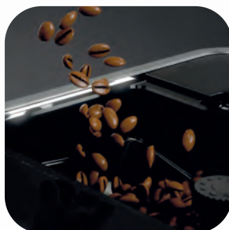
COFFEE BEAN HOPPER