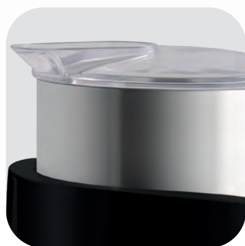
TRITAN LID DURABLE MATERIAL, BPA-FREE, CONVENIENT FUNNEL