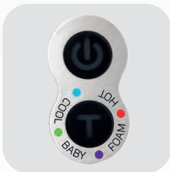
4-IN-1 HOT MILK, COOL, FOAM, BABY