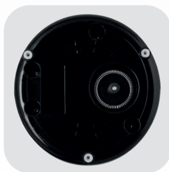
FROTHING & STIRRING DISC