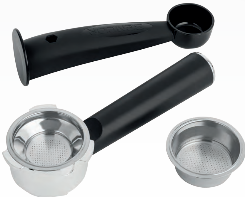
MEASURING SCOOP FILTER HOLDER TWO FILTERS (FOR 1 OR 2 CUPS)