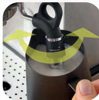
STEAM NOZZLE WITH SWIVEL MECHANISM